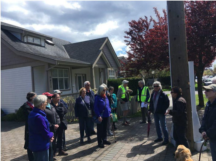
Reay Creek May 14, 2019

The big takeaways? Needs and expectations for our streets change with time. Every policy and standard has unintended consequences and good design is critical to minimizing them. However, laws and standards, with the best of intentions, will always have unintended consequences that won't always sit well with future generations. This walk was organized by Eric Diller and the SCA Transportation Committee.